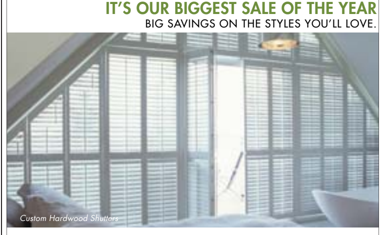
Incredible Savings, Promotions, and Upgrades On Shutters & More Going On Now!* Contact your local Style Consultant for amazing offers in your area!